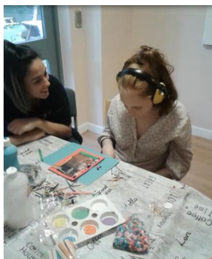
The Digital Storytelling approach helps to support children's assessments and transitions

The importance of eliciting the voices of young people and their participation within decision making on matters that affect their lives, is robustly supported within government guidelines and legislation. However, previous research suggests that due to perceived communication barriers, children and young people on the autism spectrum are frequently excluded from decision making and consultations relating to their education planning and omitted from research studies.