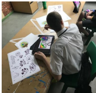
Student creating a logo.

by the University of Southampton's ESRC impact acceleration account.